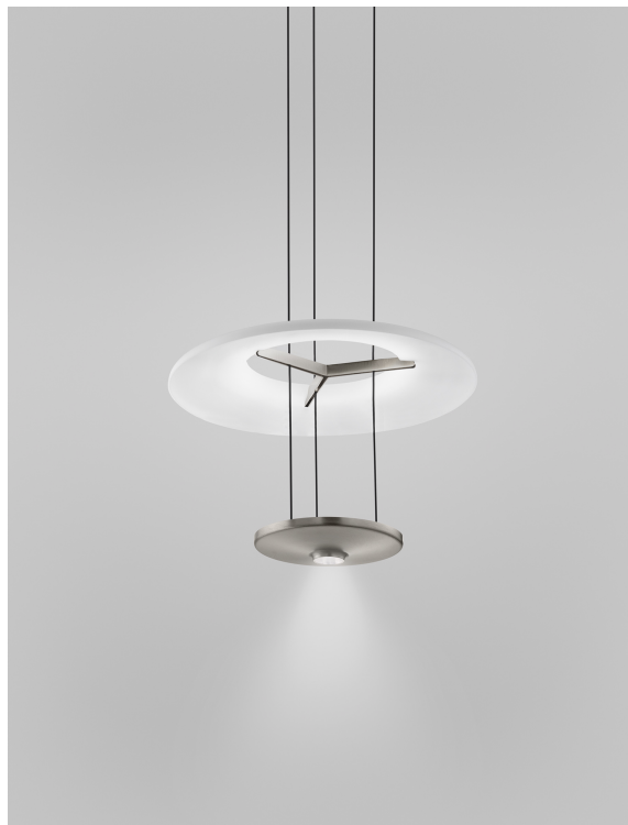
DIONE SP 1M BCST AVS L22 CE